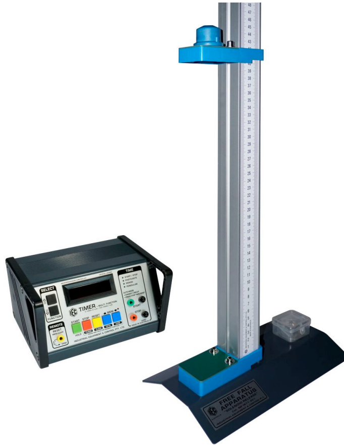
MF1871-401A (1.0m Fall, Solenoid Release, with LB4064-101 Timer)