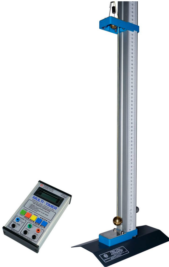
MF1871-301A (1m. with LB4057-001 Timer)