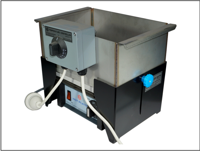
Temperature controller CH4240-101