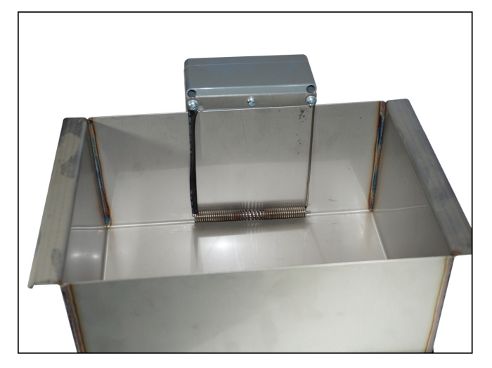
View showing temperature sensor inside the bath at the lowest level.

The controller can be used on either the front or rear edge of the bath and the physical size of the Water Bath has been made to suit 2x standard IEC test tube holders.