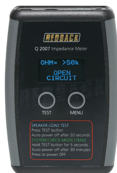
Fig 3. Redback Q 2007 Impedance Meter