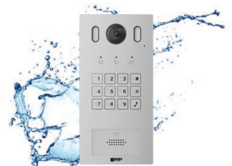
Weather & Vandal Resistant