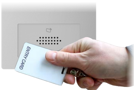
Gate Control via Keypad or Card