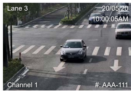
Detailed OSD Configuration