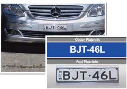
Automatic Number Plate Recognition