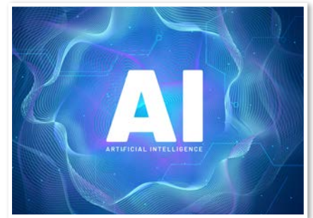
Vehicle Data Structuring with AI